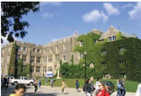
McMaster University, Hamilton

Hamilton is conveniently located 45 minutes from Toronto, which is home to the world famous CN Tower, the Royal Ontario Museum and the Ontario Science Centre and 1 ½ hours from one of the Wonders of the World, Niagara Falls. Pearson International airport is also only about 45-50 minutes drive away.