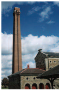
Steam and Technology Museum, Hamilton