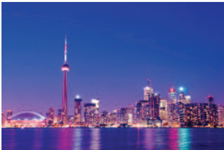
Toronto skyline by night

The conference will be a key forum for researchers, industry, regulators and experts for whom radioactivity in the environment is an interest area.