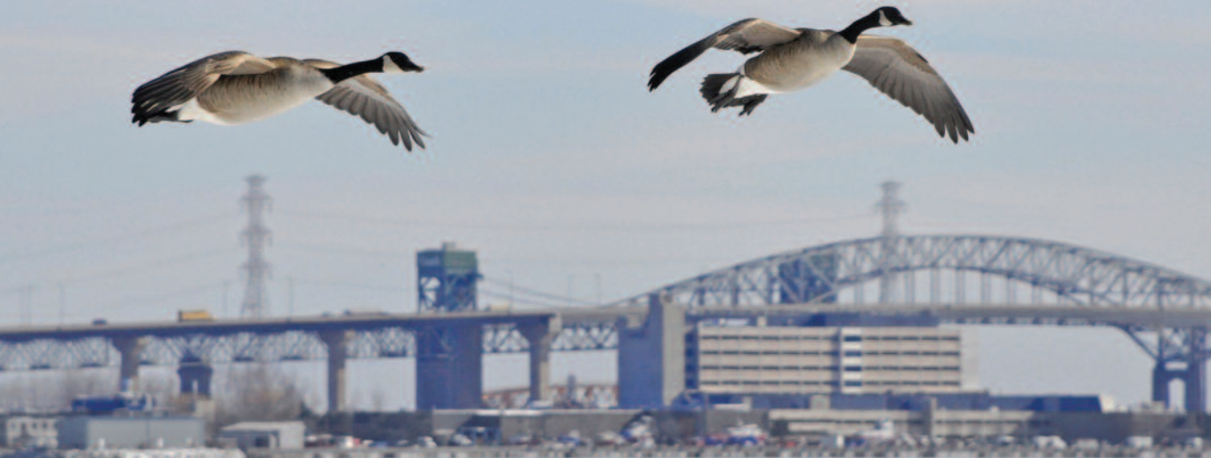
Canada Geese flying low at Lake Ontario, Hamilton Skybridge in the background